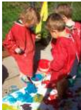
Outdoor play with Busy Bees

Children have a snack time in the morning and afternoon. Lunch is served just after noon. The nursery has a healthy eating policy and fresh fruit, vegetables and 'home cooked' food are provided.