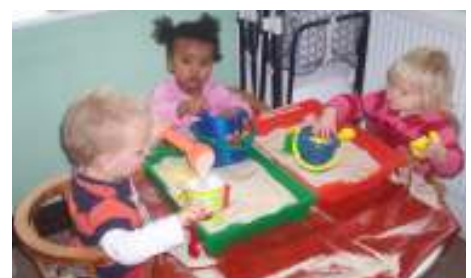
Craft activities in Lady Birds